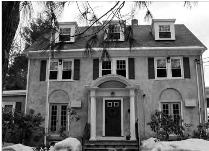
Dover-Sherborn Administration Building.

More detailed information on the year's activities can be found in the individual school committee and administrator reports that appear in the following pages of this town report. Once again, I wish to thank Dover and Sherborn citizens for their strong commitment to the Dover-Sherborn Public Schools.