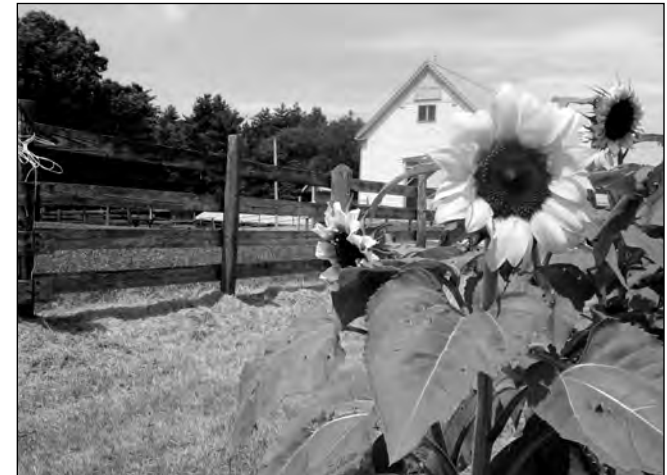
Powisset Farm.

Dover residents are encouraged to provide the Committee their comments and suggestions for improving upon future editions of this report. We can be reached at townreport@dovertownma.org .