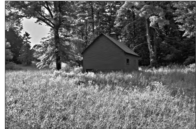
Red barn on Dedham Street.

Dover residents are encouraged to give the Committee their comments and suggestions for improving upon future editions of this report.